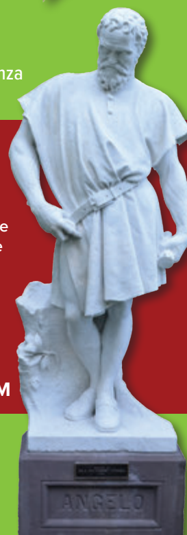
Statue of Michelangelo by Moses Ezekiel is one of eleven life-size marble sculptures on display in Statuary Vista.