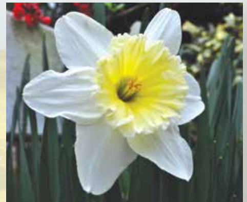
'Ice Follies' has large white petals with a corona that starts off yellow and ages to white. This tall variety is also good for naturalizing.

One of the earliest daffodils to bloom, 'Tete-a-Tete' has golden yellow petals and a slightly darker corona. Don't let its diminutive size fool you, this reliable variety is a vigorous spreader.