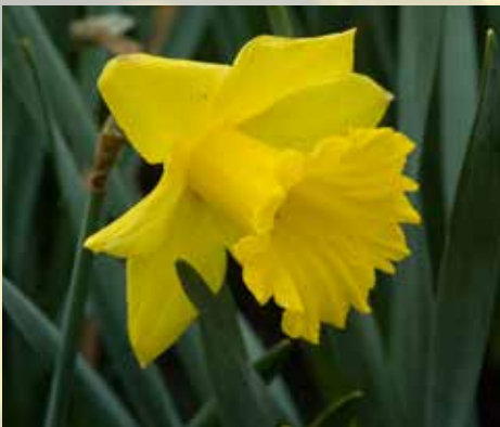
Listed as one of the best for naturalizing in the South, 'Carlton' also has one of the largest flowers (up to 5"), and it has a sweet vanilla fragrance as well.

Narcissus , or daffodils if you prefer, are native to the Mediterranean areas of Europe and Africa. Depending on whom you speak with, there can be anywhere from 40 to 150 different species, and there are over 20,000 different registered cultivars. Here at Norfolk Botanical Garden, in terms of sheer numbers, Narcissus is our largest collection with over 100,000 individual plants, represented by well over 400 different varieties and species. With numbers like that, it could make your head spin trying to make selections for your own garden, but the following are some that we feel belong on the “must-have” list.