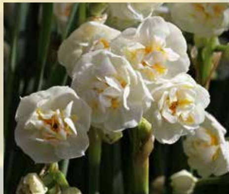
'Cheerfulness' is known for its double ivory colored flowers flecked with golden yellow in the center. There are multiple fragrant flowers on each stem.