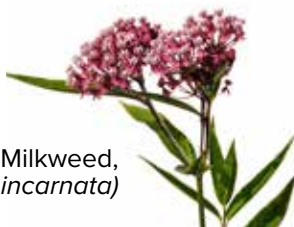
Marsh Milkweed, ( Asclepias incarnata )

Discover which hardy and rare plants you'll want to add to your weekend shopping list. Participants will take home a plant valued at $12. Walking required.